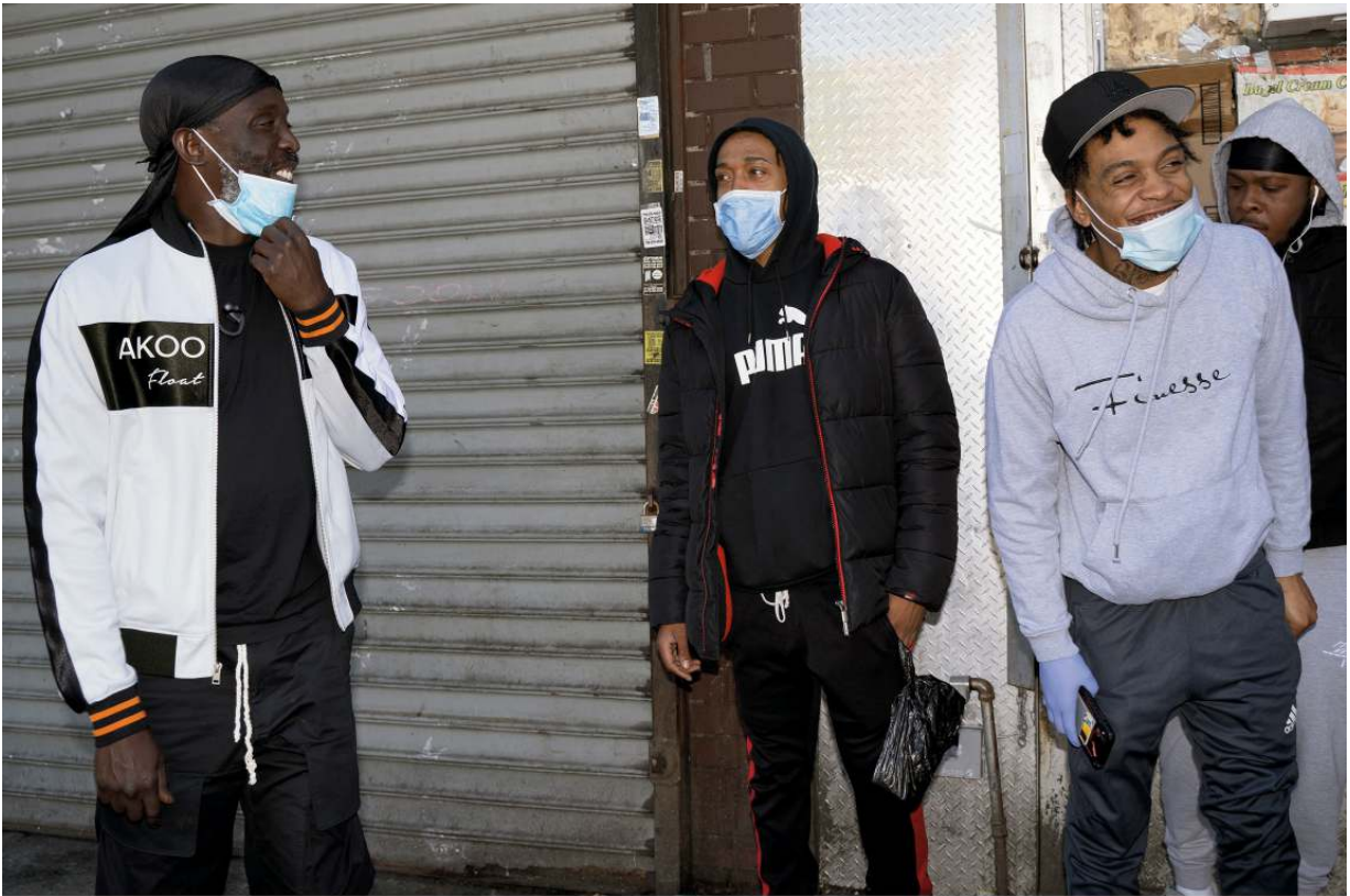
Handing out PPE in Brownsville during the first wave of COVID-19