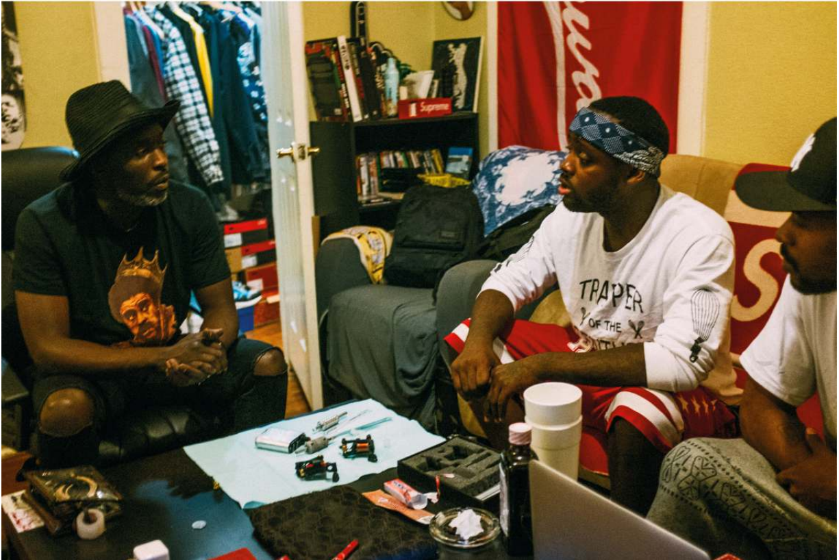
An interview in Los Angeles for the Lean episode of Black Market