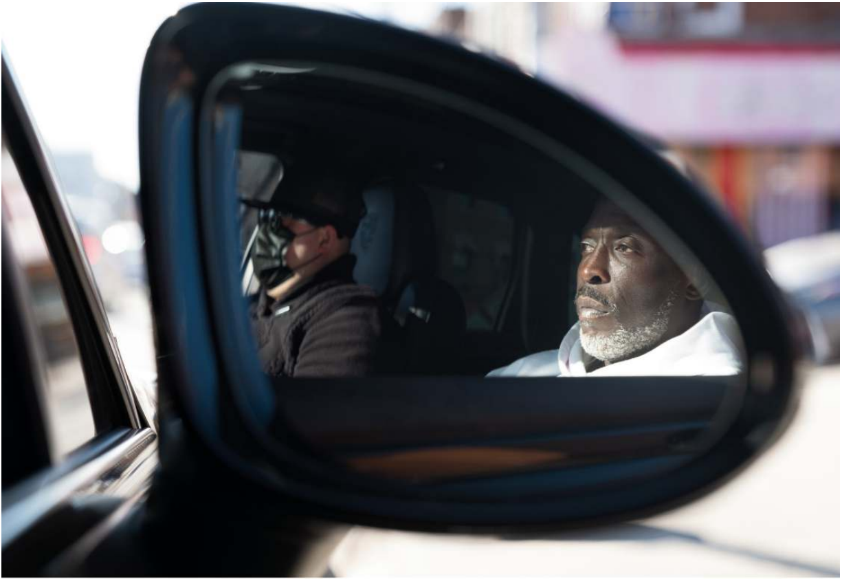
Shooting Black Market in Queens on the way to a gap house