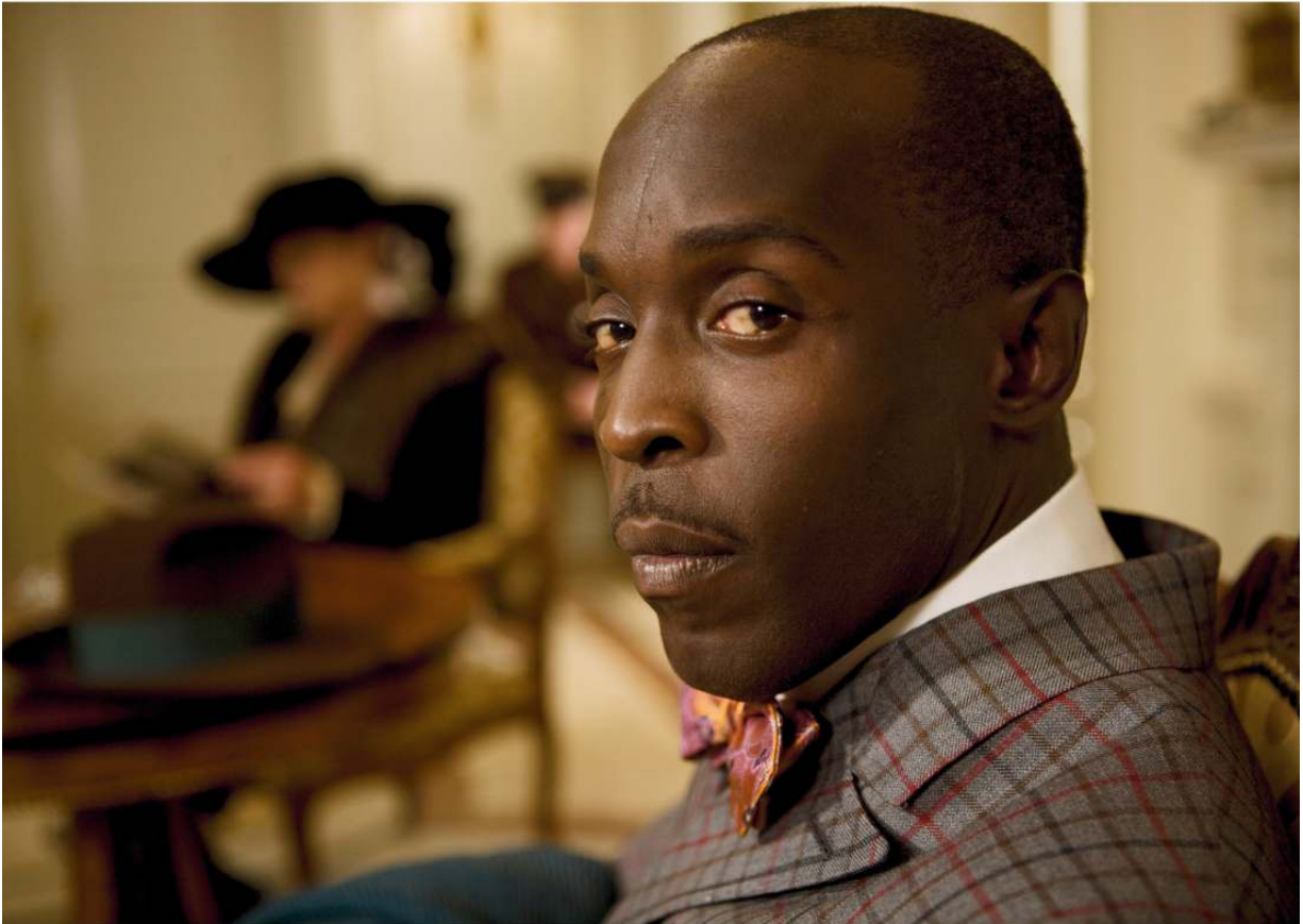
Chalky White in Boardwalk Empire