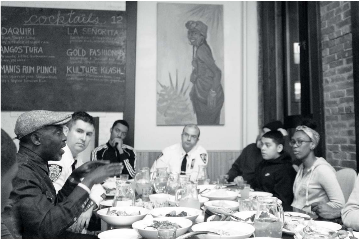
At a social justice dinner with rapper Styles P, local law enforcement, and community youth