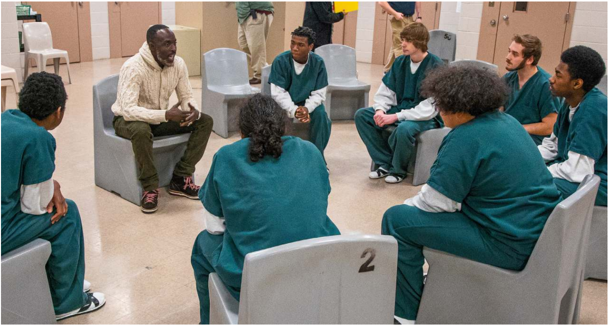
Speaking with kids at Lucas County Juvenile Justice Center in Toledo, Ohio