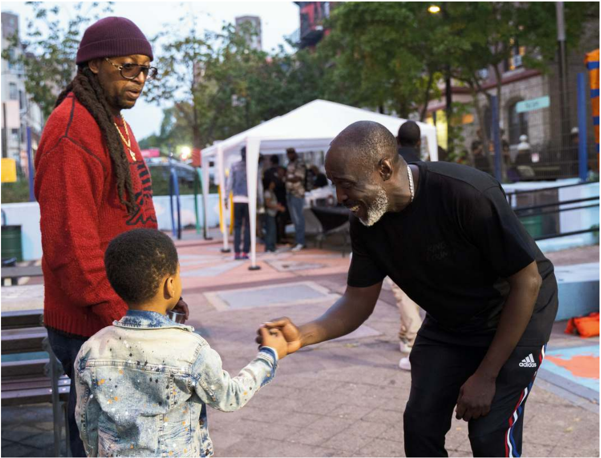
First block activation for We Build the Block in Crown Heights