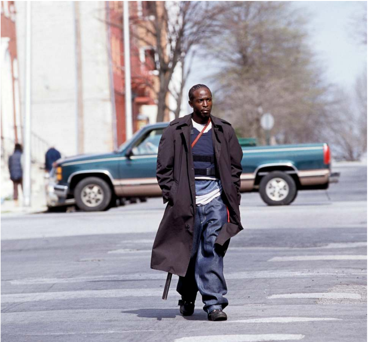
Omar Little in The Wire