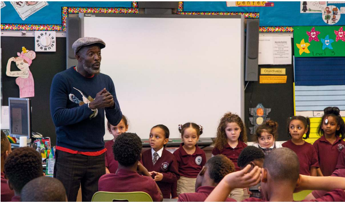
Speaking to students at Luis Muñoz Marin Elementary School for Social Justice in Newark for Raised in the System