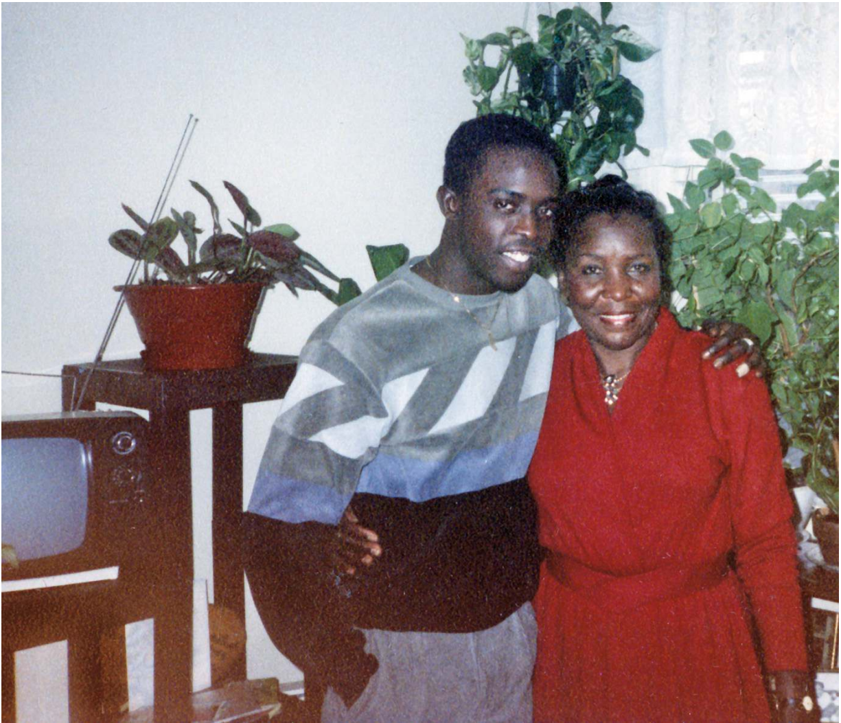
Mom and me