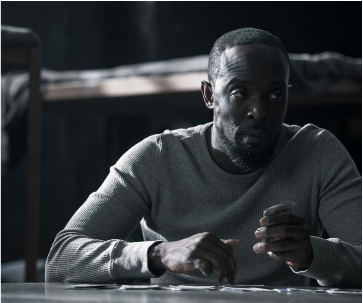
Freddy Knight in The Night Of