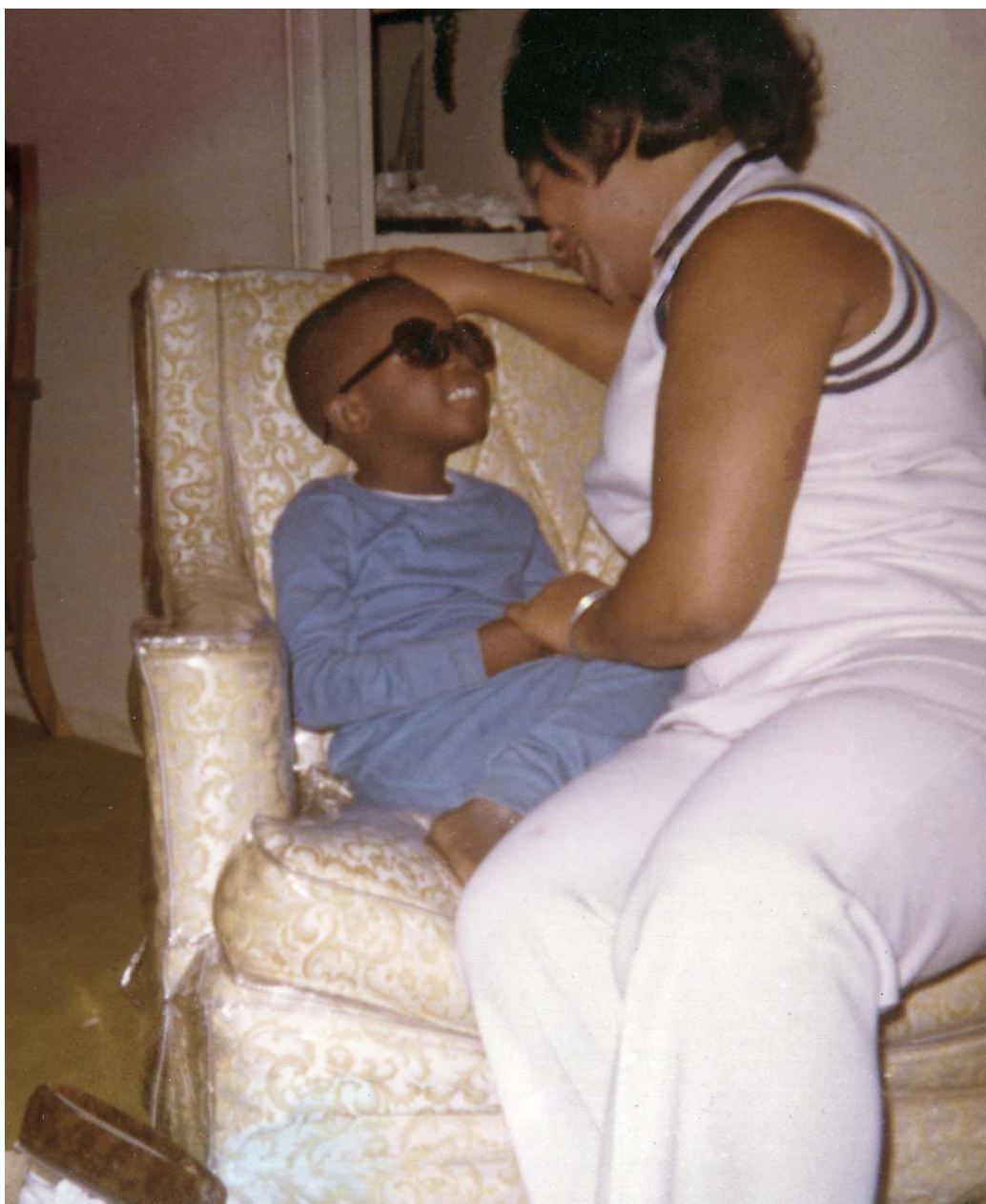
With a family friend in our apartment