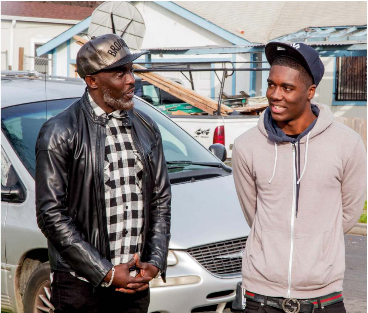
Talking to an Office of Neighborhood Safety (ONS) program member in Richmond, California