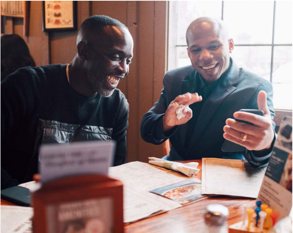
Celebrating at a Cracker Barrel