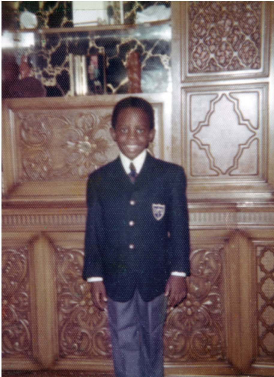
In front of our entertainment center